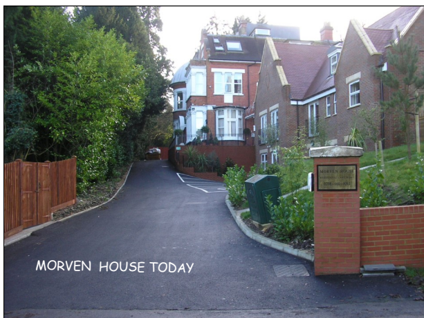
MORVEN HOUSE TODAY

It is easy these days to set up or amend a standing order on line with your bank so please do so as soon as possible. If you cannot pay by standing order, a cheque or cash is acceptable and if you want to send the levy via BACS transfer the account details above can be used.