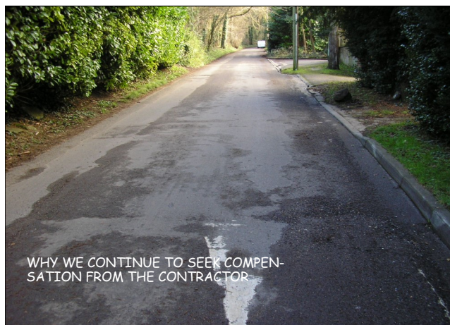
WHY WE CONTINUE TO SEEK COMPENSATION FROM THE CONTRACTOR